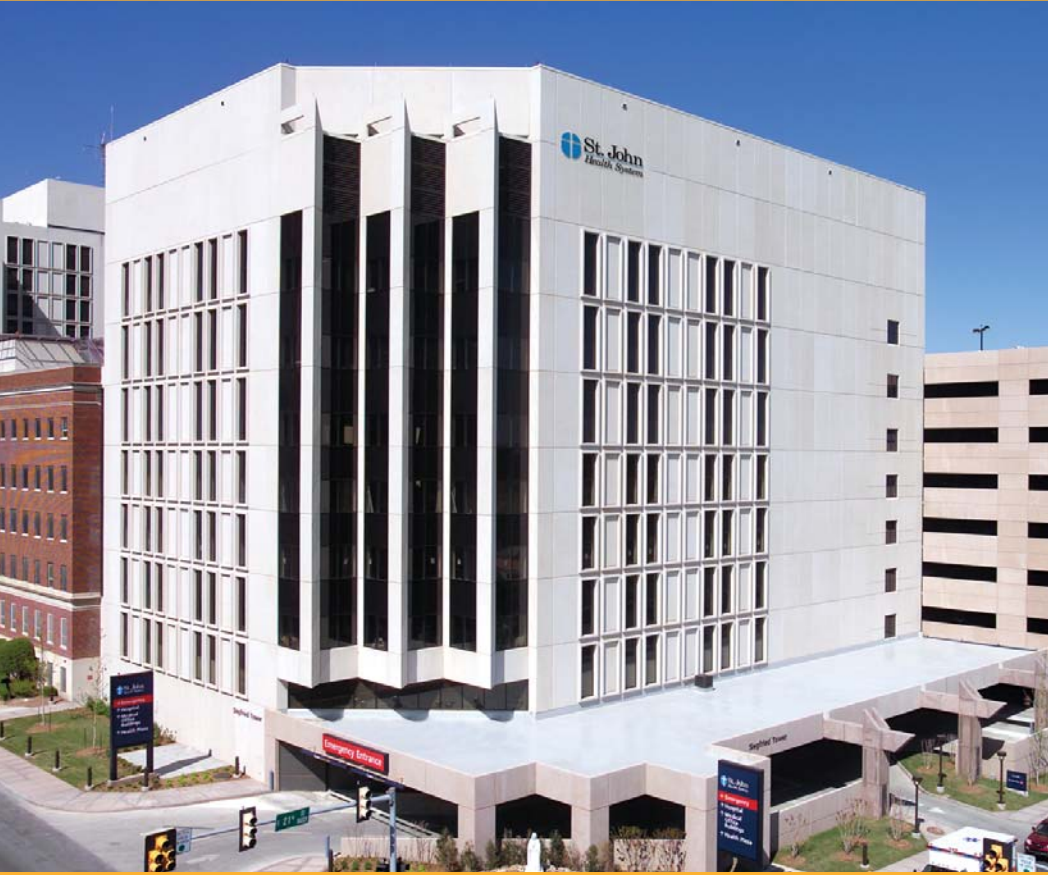
St. John Medical Center, Tulsa, OK

To meet an increase in demand for medical services, the owners of St. John Medical Center recently expanded their complex — including the 500 bed hospital. Located in the heart of Tulsa, OK, the medical center is subjected to the threat of rain throughout the year with occasional large hail and violent windstorms.