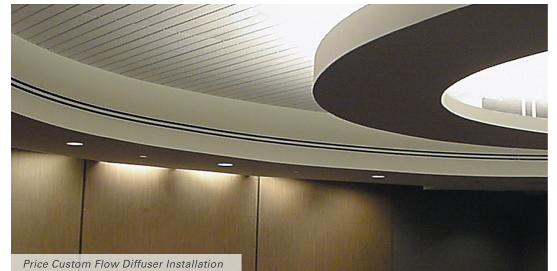
Price Custom Flow Diffuser Installation